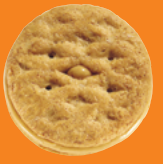
Peanut Butter Sandwich