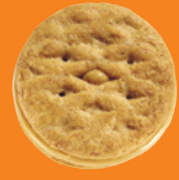
Peanut Butter Sandwich