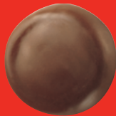
Peanut Butter Patties