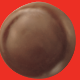
Peanut Butter Patties